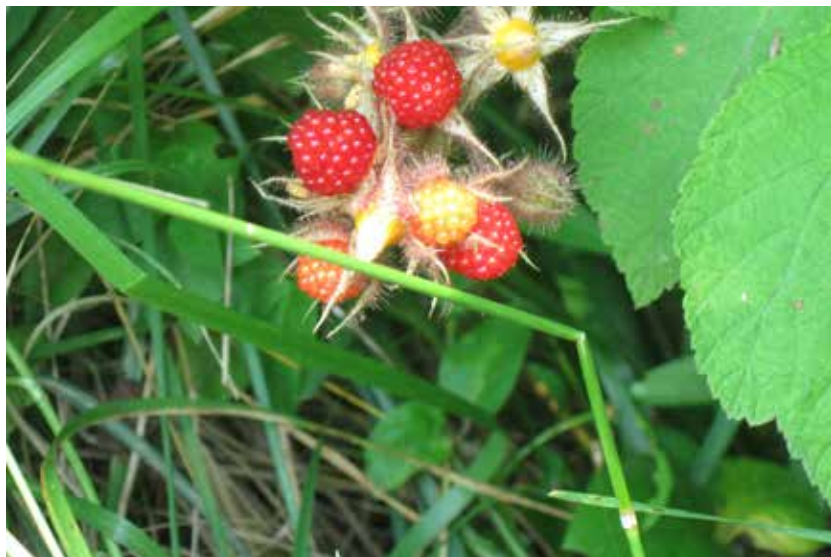
Wineberries, still slightly underripe

bloomy finish, wineberries are shiny, with a sticky or tacky surface. Euell Gibbons, one of the few naturalists treating the wineberry, claims that it is “a recent immigrant from Asia,” but that is not what I grew up hearing. Though they have now spread to all the middle Atlantic states, according to local legend they were introduced east of the Blue Ridge, to his estate near Charlottesville, around the turn of the nineteenth century, by none other than that greatest of all American horticulturists, Thomas Jefferson.