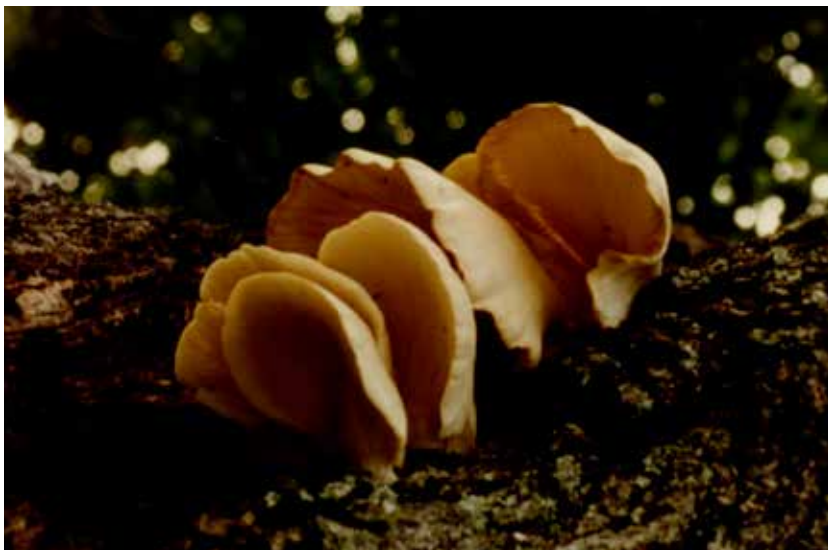
Oyster mushrooms ( Pleurotus ostreatus )

The botanical name of this mushroom, Pleurotus ostreatus or P. sapidus , comes from the word for the lining of the thorax that covers the lungs, pleura , and is kin to our word for the inflammation of that lining, pleurisy. It is likely that the shape of the mushroom suggested this name. Ostreatus is Latin for “oyster,” and sapidus means “flavorful” or “sapid.”