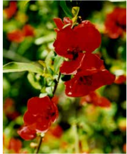
Quince bloom in spring, 4 to 5 months before the fruit.

tree. Oblonga describes an oblong fruit shape, maliformis indicates a lopsided apple-like fruit, and sinensis points to a Chinese origin. The genus is probably named for the ancient city of Cydon, on Crete. But another possibility is that the name, from cy , meaning “circular,” and donia , a “gift,” kin to our word donate , implies that quinces are “circular gifts.” The Portuguese word for quince, marmelo , gives us our word marmalade . Most quinces found in America originated in Asia. My grandparents called their quince hedge japonica , which might confirm its origins.