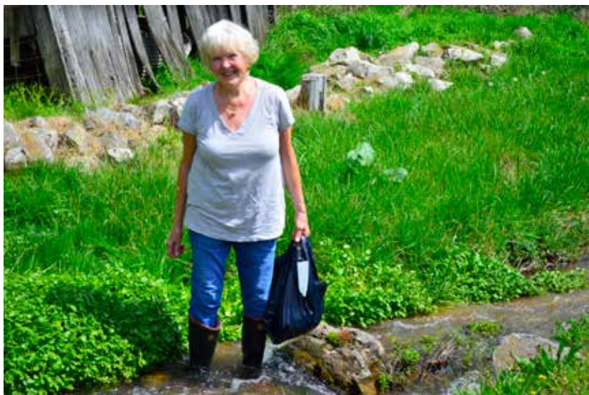
The author gathers watercress.