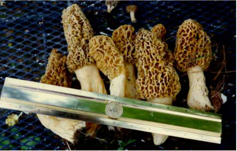
Golden morels emerge later than the dark ones in Appalachia.

simply the Latin term for “mushroom,” and esculenta and deliciosa mean that one is “edible” and the other “delicious.” Angusticeps means “narrow,” and appalachiensis is the name of the subspecies that grows in the Appalachian Mountains from Newfoundland to Georgia; mycologists differ on whether it is a different subspecies from angusticeps .